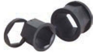
Standard reducer inserts selection chart

Can order imperial and non-standard Reducer Inserts